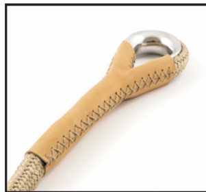
Inox Thimble with Leather