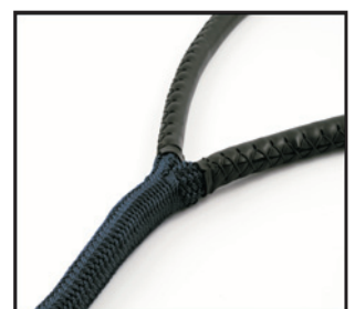
Eye with Leather