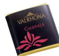
CI100 - g. 5 Grand Cru Guanaja chocolate squares