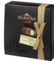
CI448 - g. 310 Tin box of 36 tasting chocolate squares