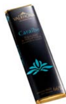
CI142 - g. 20 Caraibe dark chocolate bar