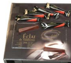
CI103 - g. 4 Éclat chocolate sticks