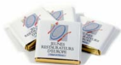
CI102 - g. 5 "Jeunes Restaurateurs Europe" chocolate squares