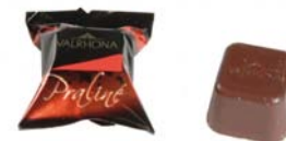
CI122 - g. 6 Deli-K crunchy praliné