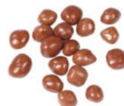
CI109 - kg. 2 Milk chocolate coated dried figs