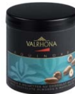
CI421 - g. 75 Milk Equinox almonds and hazelnuts box