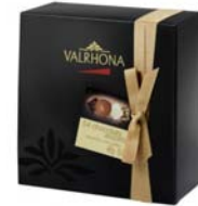
CI452 - g. 465 Tin box of 54 tasting chocolate squares