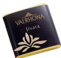
CI111 - g. 5 Grand Cru Jivara milk chocolate squares