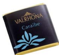
CI101 - g. 5 Grand Cru Caraibe chocolate squares