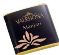
CI113 - g. 5 Grand Cru Manjari chocolate square