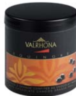
CI423 - g. 75 Dark diced candied orange rinds pack