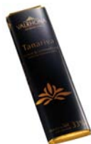
CI144 - g. 20 Tanariva milk chocolate bar