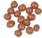
CI115 - kg. 2 Milk chocolate coated lemon peels