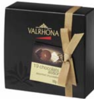
CI450 - g. 180 Tin box of 19 tasting chocolate squares