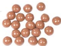
CI116 - kg. 2 Milk chocolate coated biscuits