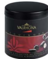
CI420 - g. 75 Dark Equinox almonds and hazelnuts box