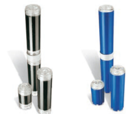
CA-POST20 Series CA-POST20 Blue Series