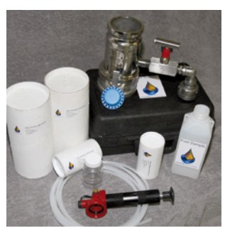
5 samples, 1 pump and 1 hose