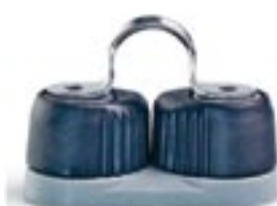
611- Ronstan Cam Cleat for up to 18mm (3/4") line (Shown w/609 line guide)

Megafend quality hardware parts are the industry's toughest products available. Many are made from durable and beautiful solid 316 stainless steel. We stock a wide variety of hardware to customize any of our fender hook products to answer your every mooring need. Megafend also has a line of related mooring products accessories including fender covers, throw bags, dock lines, tow lines and more. Style 605 Pad Eye has U.S. Patent Pending.