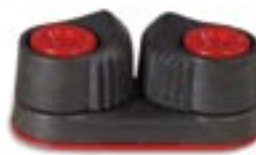
607 - Harken Cam Cleat for up to 18mm (3/4") line