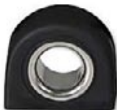
602 - Pad Eye for up to 16mm (5/8") line