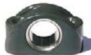
604 - Pad Eye for up to 18mm (3/4") line.

Megafend has many additional hardware items for installation on its Fender Hooks. Several of these items are so innovative as to be Patent Pending. For ordering or further information please call: +39 3396709546.