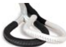
handsewn leather style applied to line eye