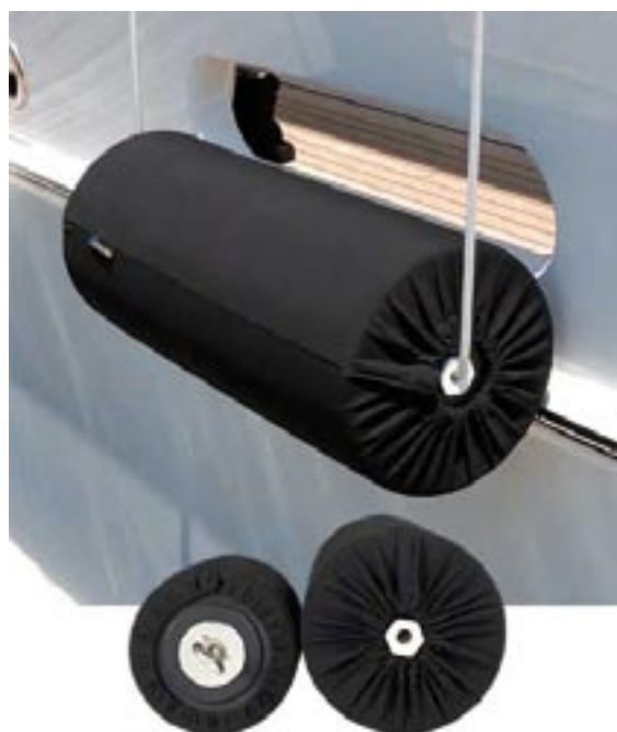
fender w/stainless steel rod kit option

Solid-Core Durability – Megafend solid core fenders are available in all the standard marine sizes and are performance engineered to withstand heavy use. Each has an outer covering of quality Sunbrella® marine fabric with black being the standard color. All standard models use a 25mm (1") pvc pipe through the center. An optional stainless steel rod kit is available for conditions where extreme service is the rule. Our stainless kit is equipped with a ring over each end. Specialty sizes and over 100 colors are available on request. We'll also recover your existing fenders, even if made by others, when needed.