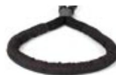
ballistic style applied to line eye