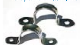
608 - Line Guide for up to 16mm (5/8") line