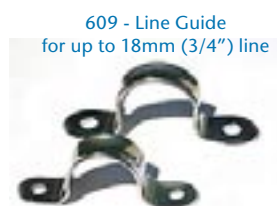
609 - Line Guide for up to 18mm (3/4") line