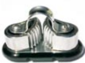
601 - Schaefer Cam Cleat with 608 line guide for up to 16mm (5/8") line