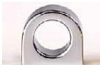
605 - Pad Eye, polished, solid 316 stainless steel for up to 18mm (3/4") line.