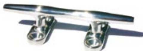
610 - Cleat 102mm (4") wide